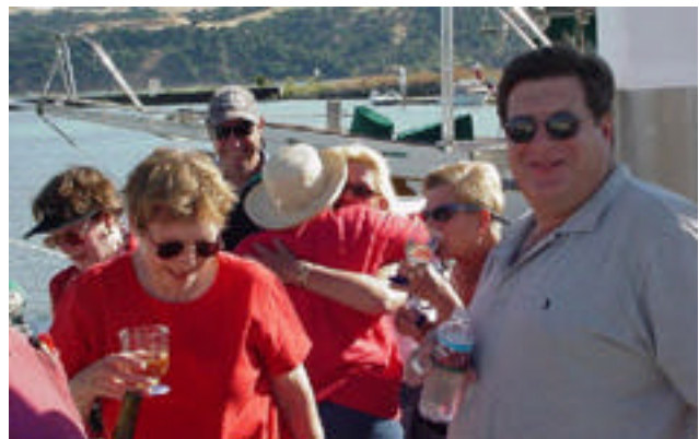
Cruising Fun last year at Benicia

Cruise coordinators get to do the fun stuff: plan the trip details, including meals--onboard or at a restaurant--and act as hosts for the event. No experience necessary--all you need is a sense of fun.