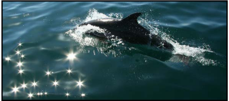
Dolphins in the Sea of Cortez swimming in the night sky

One night we observed what had to have been space junk rocket across the skies and explode in a flash of orange. Other nights, the boat would be surrounded by a greenish glow which appeared to emanate from deep within the ocean. We enjoyed a spectacular visit one night as a pair of dolphins rocketed towards the starboard aft section of Sensei. These two creatures looked like torpedoes headed right