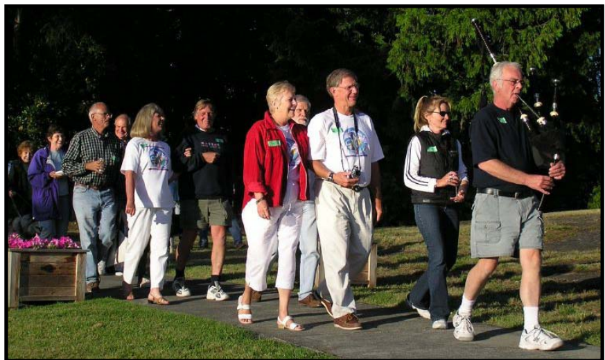
The Pied Piper leads 2005 Rendezvous participants back to the dock

Check the Islander 36 web site's Upcoming Events at www.Islander36.org a few weeks prior to each cruise date for details, further information, and sign ups.