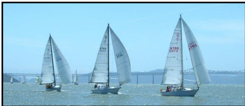
Parade of Islanders in Vallejo