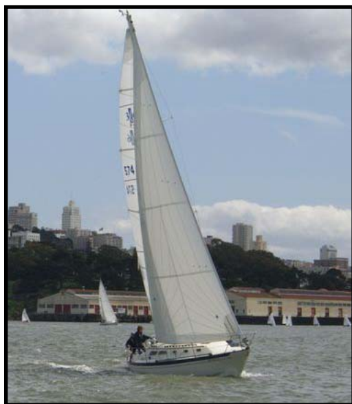
Pacific High racing off Fort Mason

It was mostly overcast with a light breeze, filling in to a 15 knot westerly.