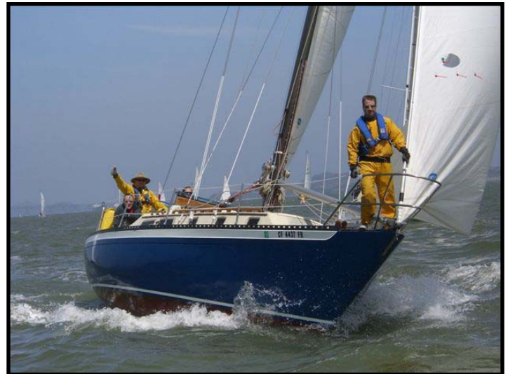
Mustang at the Saturday start of the Vallejo race