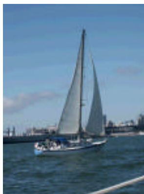
Landis' Seafare at sail, Coyote Pt. Cruise

29 boats participated in 5 Cruises in our 2002 Cruise Season