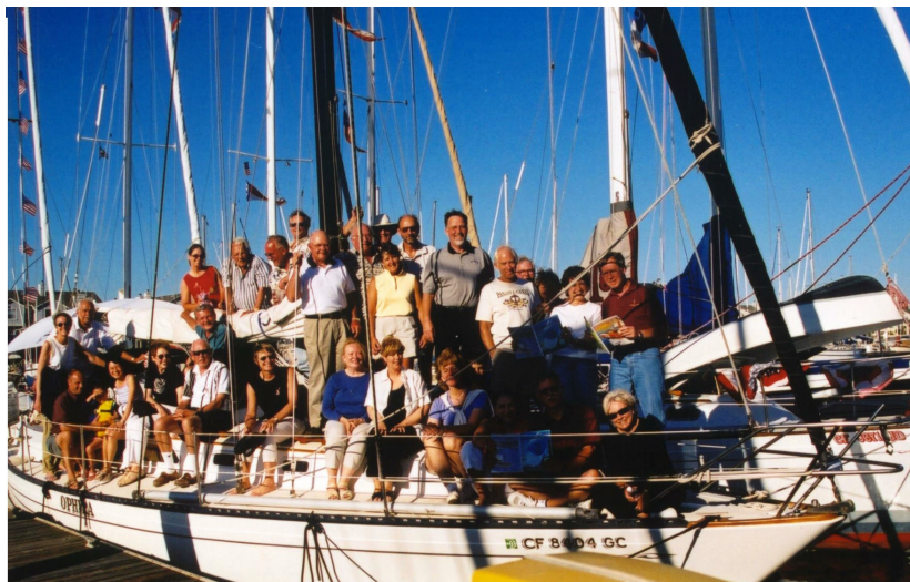
How many people can you get on an Islander 36? At least 31 (on Ophira )

At 9 p.m., about 20 of us walked to the end of the marina to see the fireworks and sing songs, starting with "This Land is Your Land," and ending with "God Bless America," with the National Anthem in between. Well, we weren't always on the same note, but we made a spirited