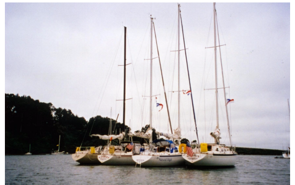
Zoop, Mischief, Natural High and Nimbus on Sunday (after Blue Moon's departure)