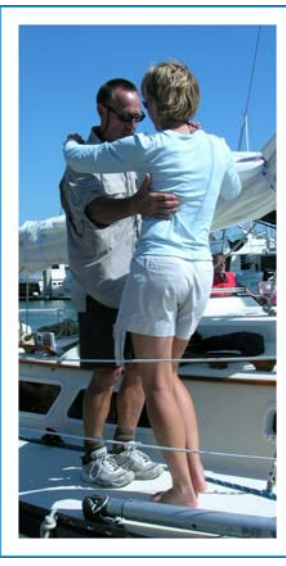
Salsa on the foredeck!