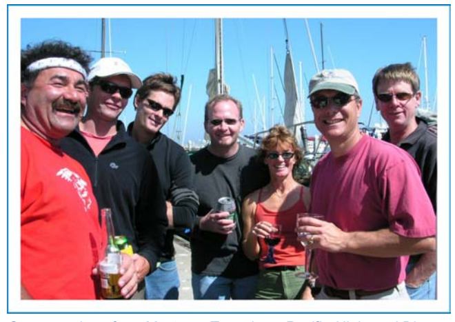
Crew members from Mustang, Tenacious, Pacific High, and Diana

Fall Meeting November 5! Gala Event at St. Francis Yacht Club, See page 7 for details