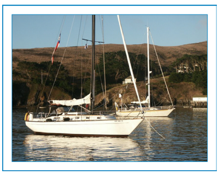
At anchor in Drakes Bay

It was a 5.5 hour motor for Snowflower and a motorsail for the rest, picking our way thru the hundreds of fishing boats, with swells 4 to 5 feet and wind waves adding chop. At Drakes Bay all I-36s anchored within 100 yards of each other. We took a nap, then gathered on Snowflower for one of our famous I-36 potlucks with 13 below for dinner. During the night the wind blew about 20