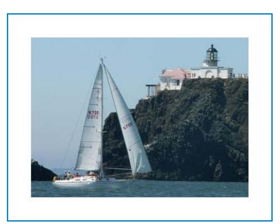
Absolute at Point Bonita Lighthouse

Midnight Sun finished so far ahead, that she was barely a dot in the distance, guiding the way to the finish line, but it was a good fight for second place, which was handily won by Absolute, followed by Diana, Tomcat and Pacific High all finishing very closely in that order. Tenacious, Windwalker, Zenith, Blue Streak, Nimbus, Mustang, and Freedom Won all finished not long after.